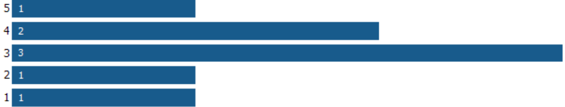
■ Sales Count by Bedroom

Data Source: Public records data Update Frequency: Monthly