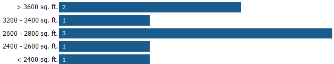
Sales Count By Living Area